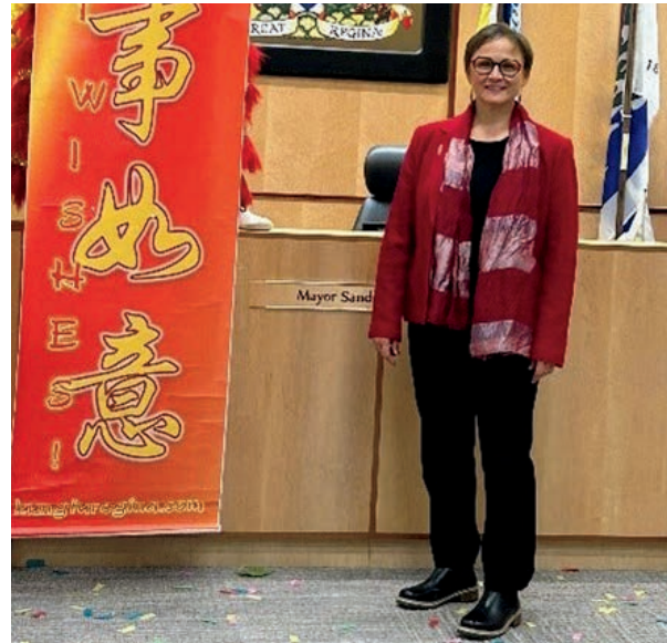
Celebration of Chinese New Year at City Hall on February 15.

many great indoor activities to enjoy in Ward 1: at the Science Centre, the Royal Saskatchewan Museum or the MacKenzie Art Gallery.