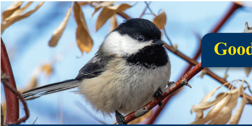
The Black-capped Chickadee soared above its competition in Regina's Bird Friendly City contest.